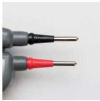
Screw on probe tip Ø4 mm (set of 4 pcs.) WAPOZN4MMK