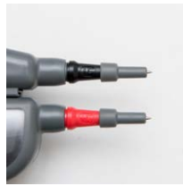
Push-on probe tips (limiters) 4 mm