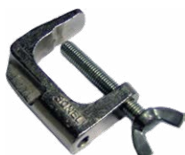
Cramp (banana plug) WAZACIMA1