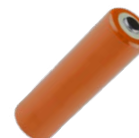
4 x alkaline battery 1.5 V AA, LR6