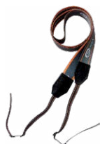
M1 hanging straps WAPOZSZE4