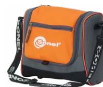
M6 carrying case WAFUTM6