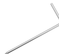
4 x earth contact test probe (rod), 25 cm WASONG25