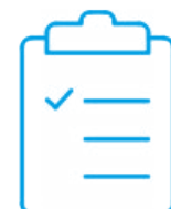
Calibration certificate with accreditation