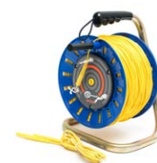
Test lead 200 m, yellow, for MRU (banana plugs, on a reel) WAPRZ200YEBBSZ