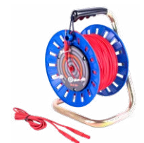
Test lead 100 m, red, for MRU (banana plugs, on a reel) WAPRZ100REBBSZ