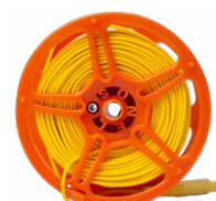
Test lead 40 m / 50 m / 60 m / 80 m for MRU (banana plugs, on a reel), yellow WAPRZ040YEBBSZ WAPRZ050YEBBSZ WAPRZ060YEBBSZ WAPRZ080YEBBSZ