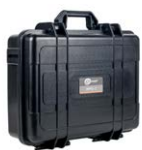
L5 carrying case