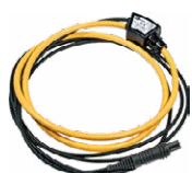
F-1A flexible clamp (Ø 360 mm)