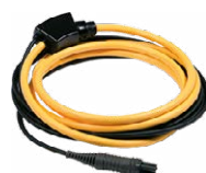
F-2A flexible clamp (Ø 235 mm)