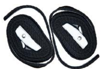
Straps for mounting on the pole