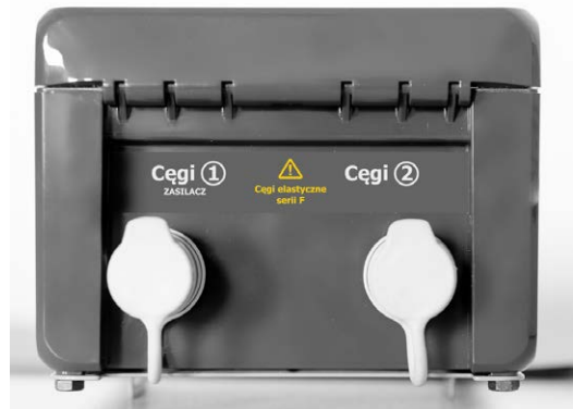
Inputs in MPU-1 signaler