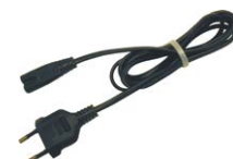
Mains cable with IEC C7 plug