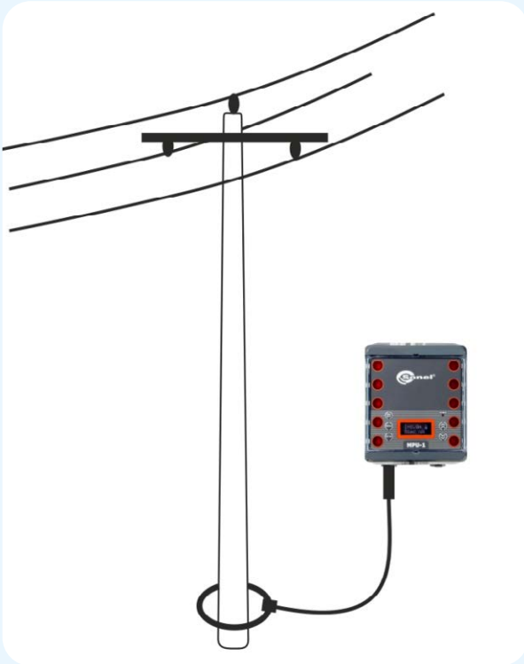
Device working with single clamp

The device shall be connected to measured power network or device