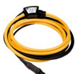
F-4 flexible clamp (Ø 630 mm)