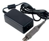
Power supply adaptor