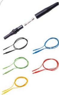
Test lead 2 m with 10 A fuse CAT IV 1000 V black / blue / green / red / yellow WAPRZ002BLBBF10 WAPRZ002BUBBF10 WAPRZ002GRBBF10 WAPRZ002REBBF10 WAPRZ002YEBBF10