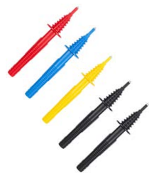
Pin probe (banana socket) red / blue / yellow / black B1 / black B3 WASONREOGB1 WASONBUOGB1 WASONYEOGB1 WASONBLOGB1 WASONBLOGB3