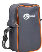
M13 carrying case WAFUTM13