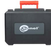
Carrying case WAWALM3